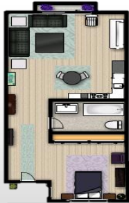
Open 1 Bed