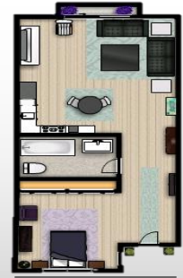
Open 1 Bed