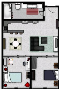
2 Room Loft

Make Brea Downtown your home and get on the wait list today!